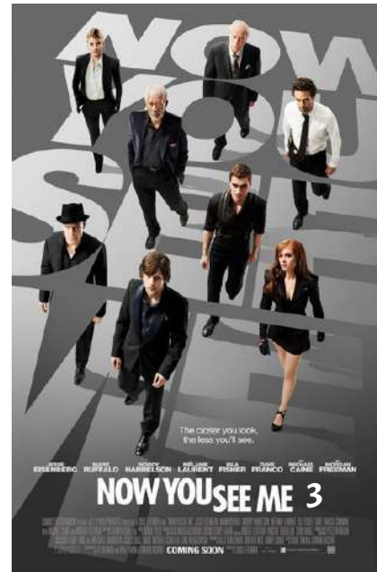
Unofficial poster for visualisation

Now You See Me 3 was a pivotal moment in my career, as it marked my first experience as a main unit 2nd AC on a major Hollywood production. Leading up to the first day of shooting, there was a mix of excitement and nerves. However, after meeting the rest of the camera team and familiarizing myself with the equipment, I quickly found my stride, and the process became seamless. The majority of the film was shot overnight, with our days starting at sunset and wrapping near sunrise for an entire week. That experience solidified my passion for the role of a main unit camera assistant - it was clear to me that this is where I belong.