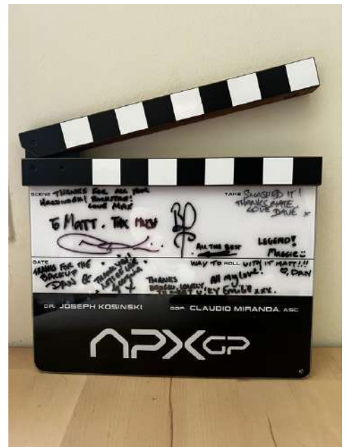
My Slate signed by Brad Pitt and Camera Dept