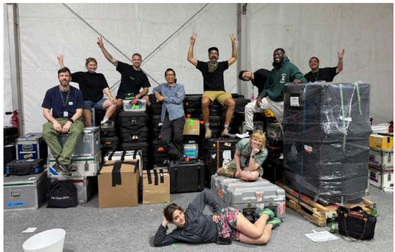
Last group photo of the movie!