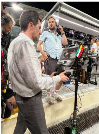
Dir. Joseph Kosinski, Pulling focus on a shot