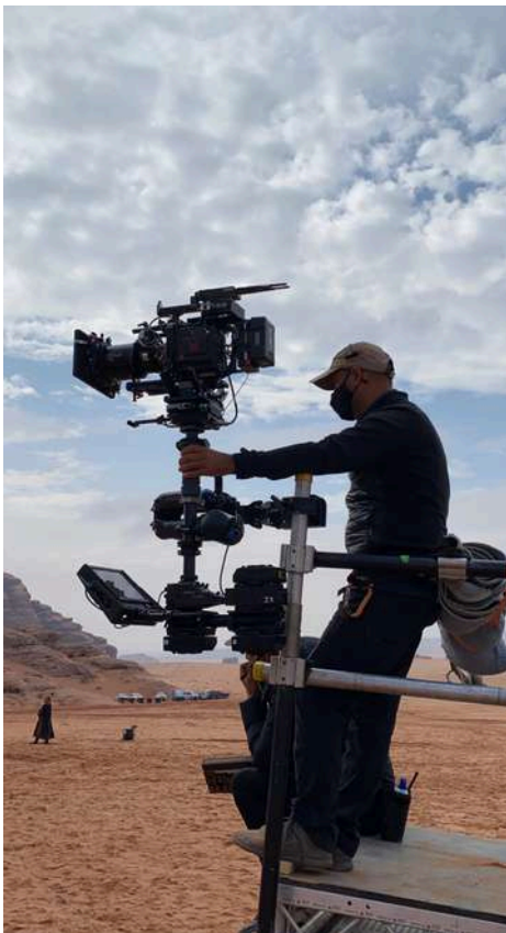
"A" Camera Operator lining up a shot