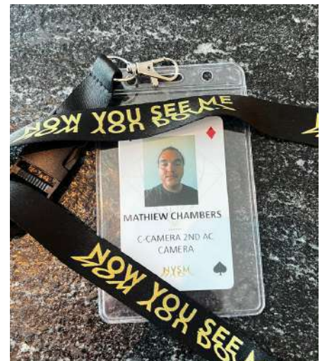
My Crew ID