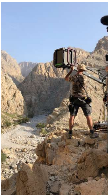
On set in Wadi Naqab