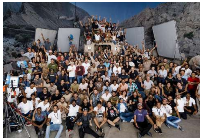
Last Day Photo