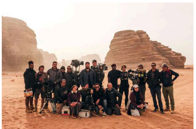
Entire Camera Dept Photo