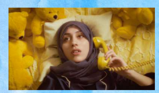
film still from Babaoutai