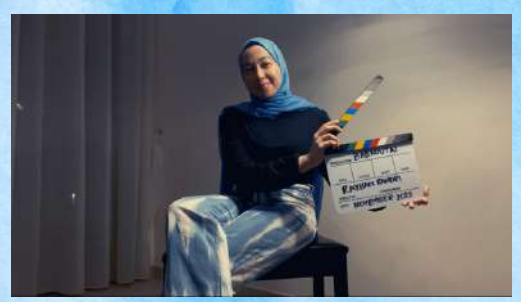
from the Babaoutai one minute pitch