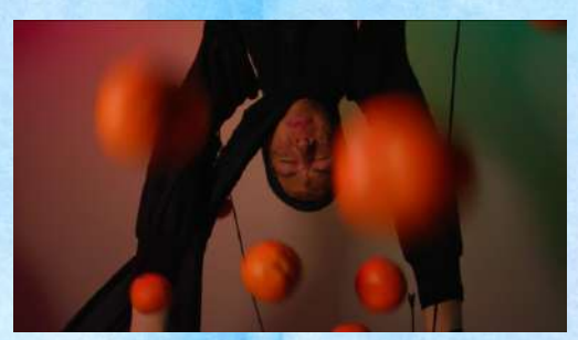
film still from We Teach Life, Sir