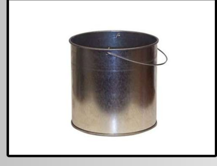
Out Door Ash Trays