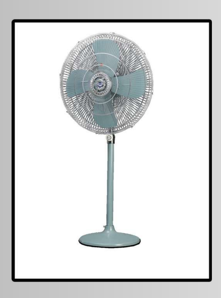
Outdoor Electric Fans