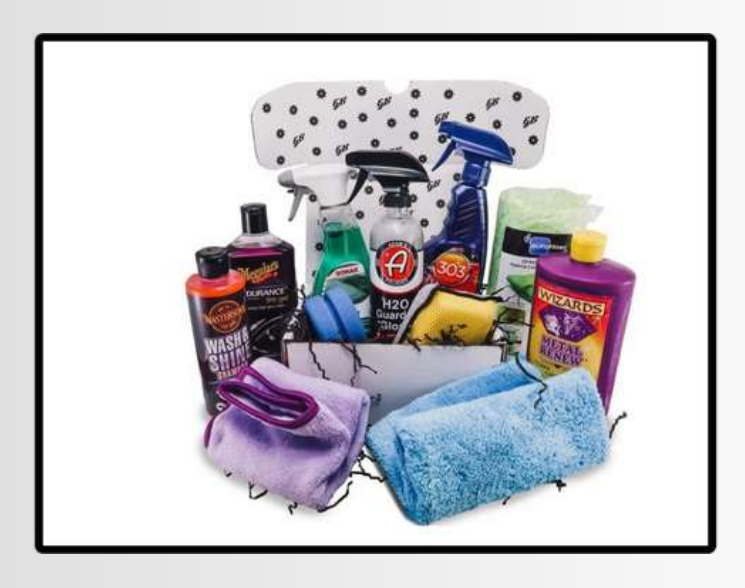
Car Cleaning Kit