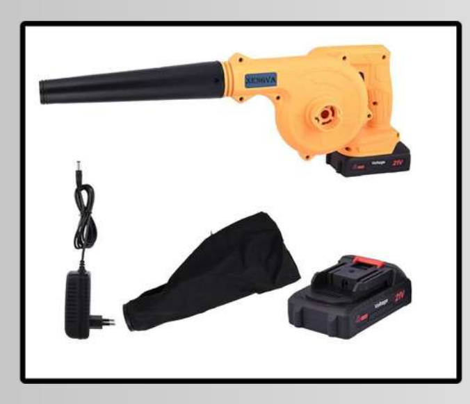
Portable Air Blower