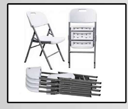
Folding Plastic Chairs