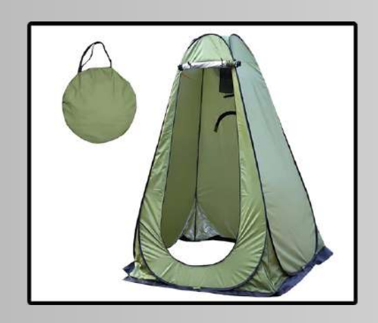
Pop Up Tents